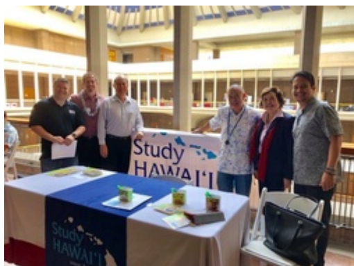
Study Hawai'i Day at the State Capital February 2018