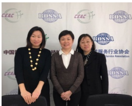
BOSSA COSSA China Virtual Fair December 2018 WeChat ID: studyhawaii