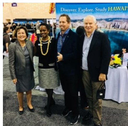
NAFSA Annual Conference May 2018 Philadelphia, PA