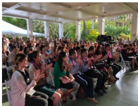
China & Taiwan Press Tour visit Oahu & Maui February 2018